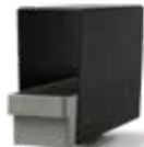
Bin Extension 24 x 6 in / 60.96 x 15.24 cm