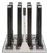
Vertical Bin Shelf