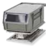
Bin with Lid